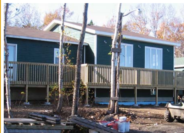
MITCHELL'S POND LODGE